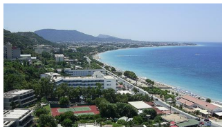
The seaside town of Ixia